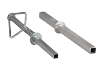
↑ ↑ wheel rim holder adapter